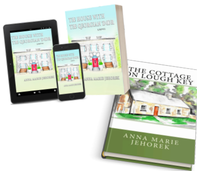
Acclaimed Novels, The Cottage on Lough Key and The House with the Georgian Door

Southern Living Magazine / The Huffington Post Travel / The Commoner Magazine/ Travel Awaits Now/AAA Carolinas Go Magazine/ Got Ireland / Irish Family Vacations / Examiner.com / Seton Magazine / Career Training Journal